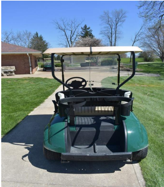
Golf Cart Partition - Back -