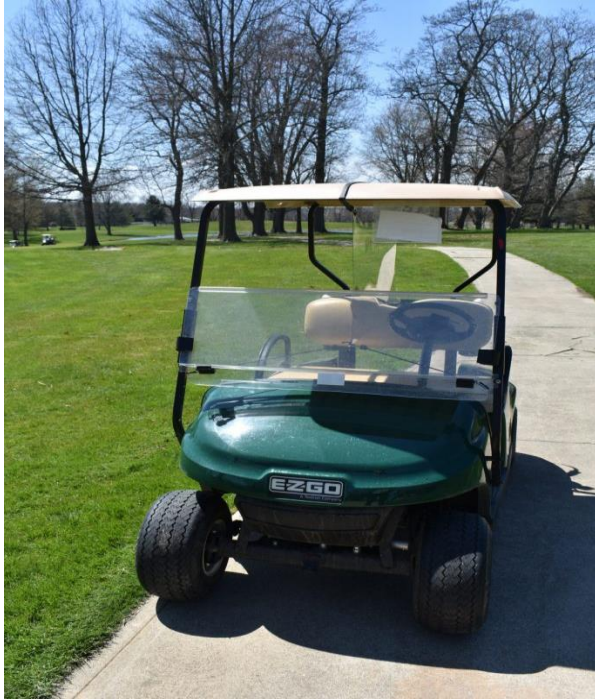
Golf Cart Partition - Front -